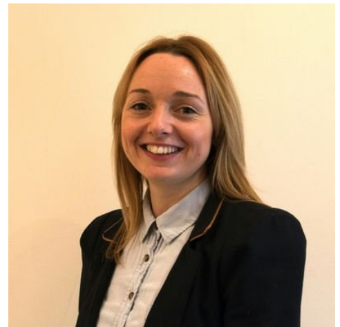
Llinos Medi Council Leader

Finally, the circumstances in the year from March onwards have changed us all. As a Council we can be proud of our staff and our communities. Together we can make a difference and by pulling together we show the strength of our small island.